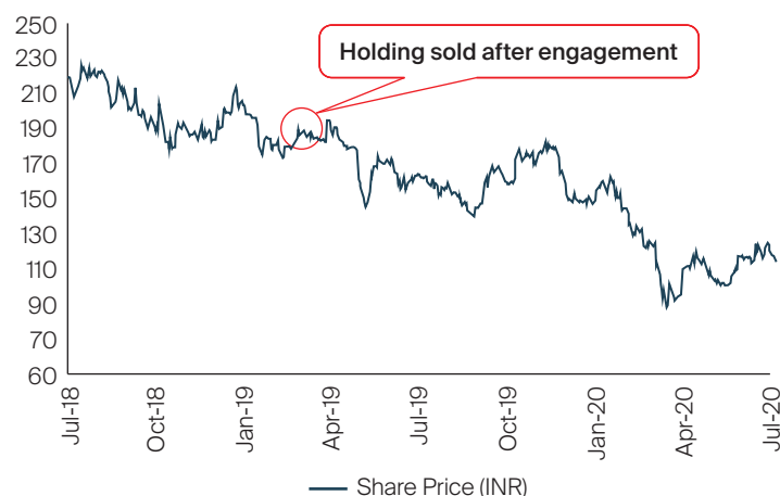
Jyothy Labs Share Price

2019 Conclusion – “It is a shame that a good business will be destroyed because the family is adamant to maintain its control, just so that each of them has something to do. A shocker of a meeting with the next CEO.”